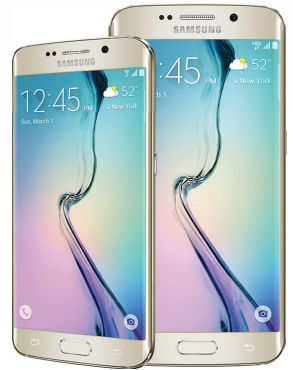
Galaxy S6 edge | Galaxy S6 edge+

Visit promos.samsungpromotions.com/edge200 for more details.